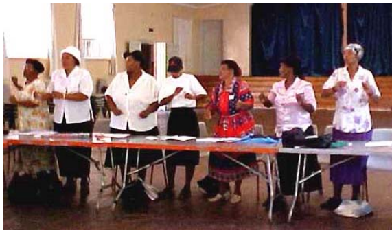
HBC givers put God first in everything they do