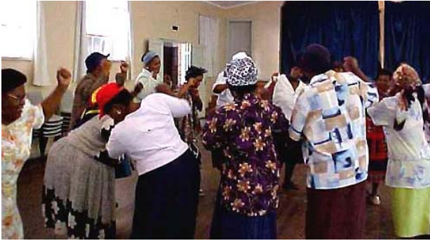
Prayers and singing before the start of the workshop