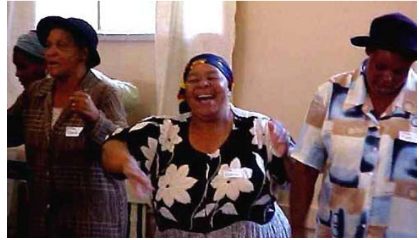
Fun-filled singing and dancing characterised the HBC workshop process