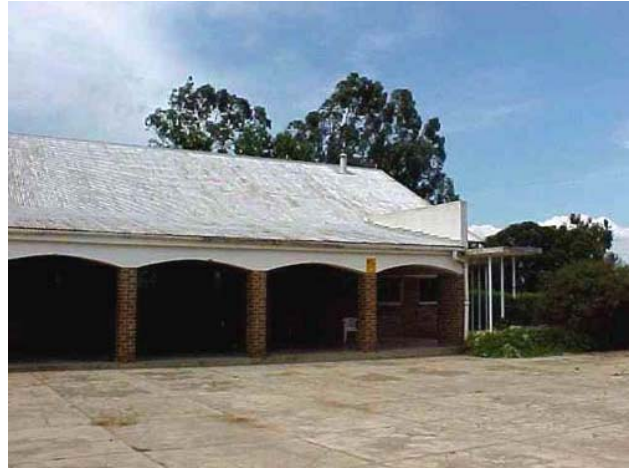
The Bergville Farmers Hall where the Home-Based Care (HBC) workshop was held