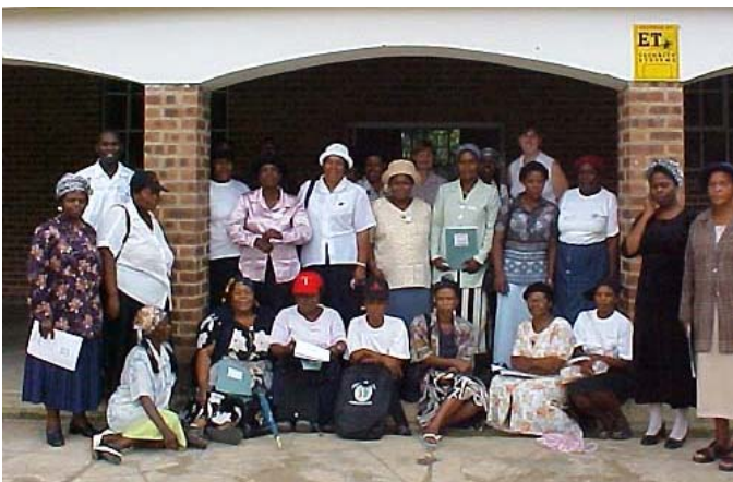
HIVAN's Bergville HBC workshop group