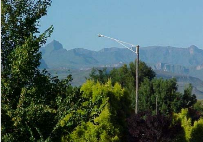
Bergville has a beautiful view of part of a Drakensberg mountain